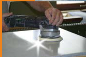
GFRP/GRP (Fiberglass/plastic materials)