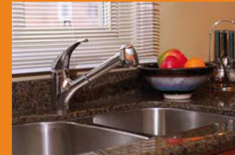
Solid surface material