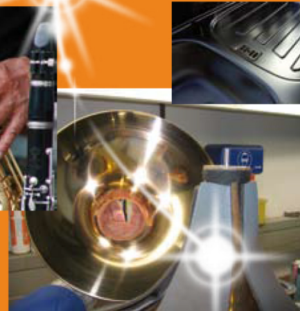
Stainless Steel & NF metals