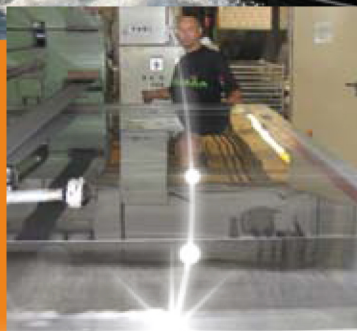
Paints and varnishes