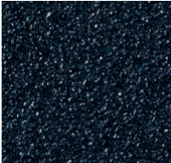
Sanding particles are close together and more evenly distributed.