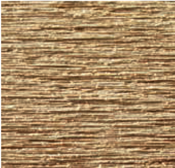
The surface that has been sanded by Bona Abrasives is smoother, more even, with visibly less fibre ripping.